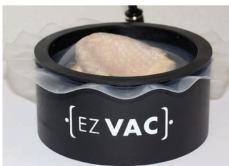
Fig. 6: The model is placed in the EZ VAC vacuum unit, which compresses the fibers for highest strength and adapts the mesh to the shape of the model