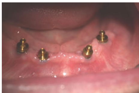
Fig. 3: After five months osteo-integration of the implants, several balls attachments are screwed on the implants.