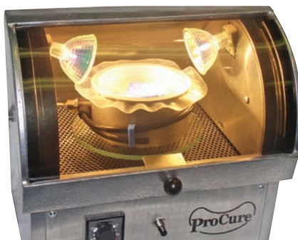
Fig. 7: Minimizing the thickness of the framework. The complete case is inserted into any lab light curing unit and then polymerized.