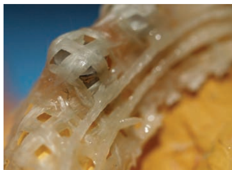
Fig. 8: The wax is removed and the polymerized mesh is trimmed and returned to the model.