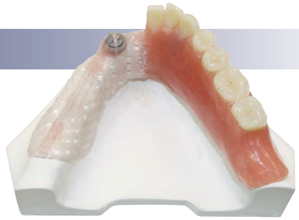
Demonstration model shows overdenture fiber structure on the left and a finished denture on the right