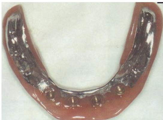
Fig. 1: Cast metal frameworks are unsightly, heavy, and do not bond (only mechanical bond) to denture acrylics