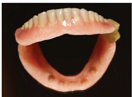
Fig. 9: The denture is then fabricated using either a press or injection technique, and the precision attachments are bonded in the mouth or indirectly when packing or injecting the acrylic. The resulting denture is esthetic, strong, lightweight and highly fatigue resistant.