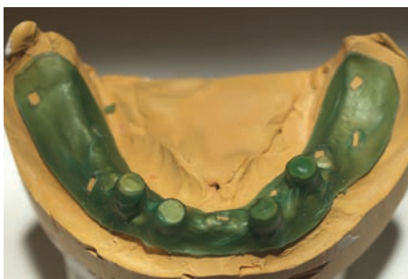
Fig. 4: Tissue stops are cut out in the wax spacer. With metal caps already in place on attachments, a wax spacer as thin as 0.5mm is made to create space.