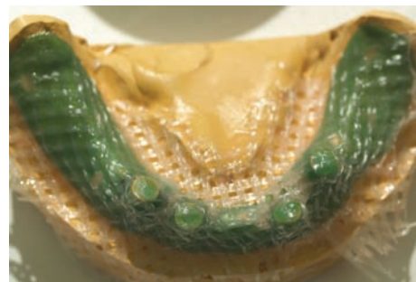
Fig. 5: The Fiber Force mesh is roughly cut to size, placed on the model.